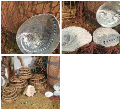
Mother of Pearl Sea Shell, Approx. 15 - 19 cm tall