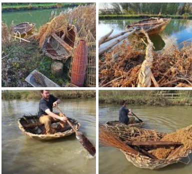
Medieval River Settlement – 2 x Coracles, 2 x Fish Traps, 1 x Eel Trap, Rustic Net and Rush Rope Hank - RENTAL ONLY