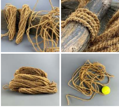
Coir Twine Hanks x 3, Each Hank 10 m Long, 4 mm Diameter, Natural Rope