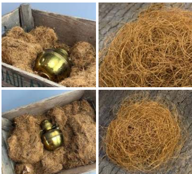
Coir Fibre/Coconut Hair x 1 kg, traditional, natural packing material, used for shipping containers to saddle construction