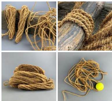
Coir Twine Hanks x 3, Each Hank 10 m Long, 4 mm Diameter, Natural Rope