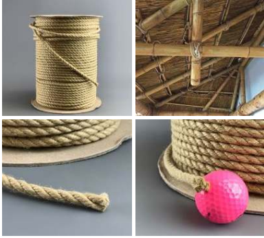
Thatch Tile Fixing Rope x 10 m by 8 mm diameter, natural effect synthetic rope