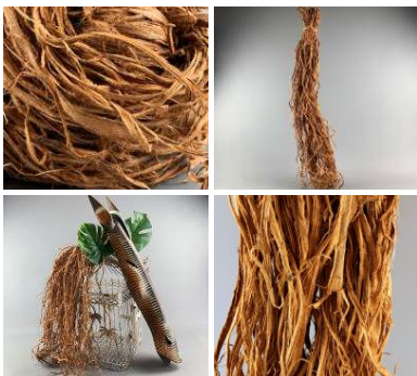
Bark Ribbon Hank, at least 1.1 m long by 8 cm diameter, natural pliable soft twine like

Coir Fibres (Coconut hair) This fine mixed ginger coconut fibre (Coir) is supplied in 1kg bags.