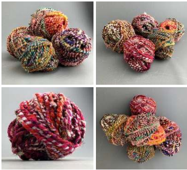
Cotton Rolls, Various Colours