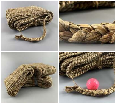
Rough Plaited Rush Hank Rope/Twine - 2 cm x 10 m long (approx 0.2 kg weight)