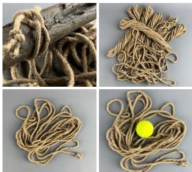
Jute Rope Hank, Approx. 10 m long, 5 mm Diameter Natural Rope