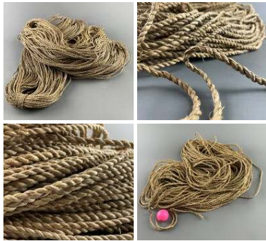
Finely Plaited Rush Twine Rope Hank x 120 m approx.