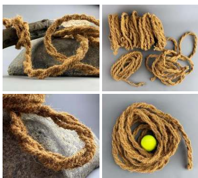
Coir Plaited Twine approx. 5m long by 2 cm Diameter. Natural twine