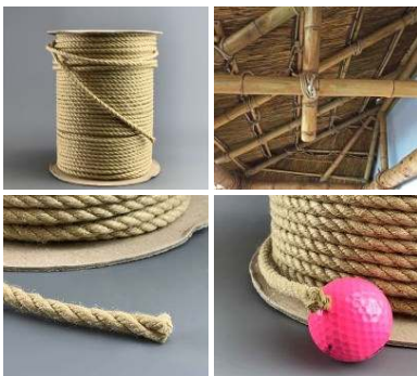
Thatch Tile Fixing Rope x 10 m by 8 mm diameter, natural effect synthetic rope