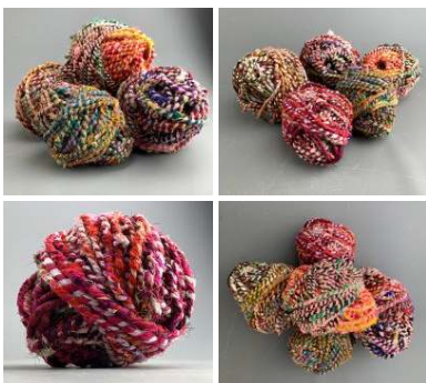
Cotton Rolls, Various Colours