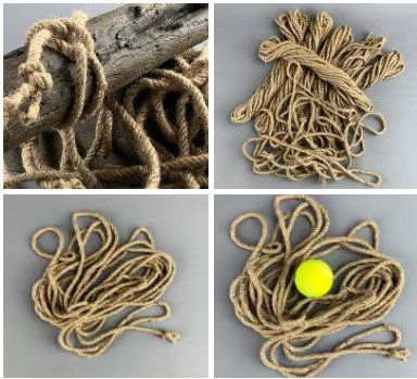
Jute Rope Hank, Approx. 10 m long, 5 mm Diameter Natural Rope