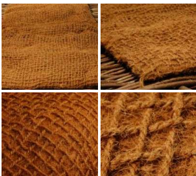
Stuffed Coir Net Sack, approx. 2 m long x 80 cm wide x approx 12 cm height. Ideal baggage/cart dressing

This dried brown tree grass is almost suede or leather like but is a natural bark like grass.