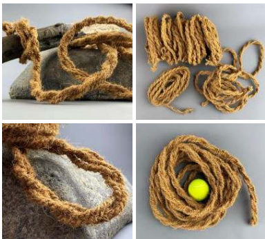
Coir Plaited Twine approx. 5m long by 2 cm Diameter. Natural twine