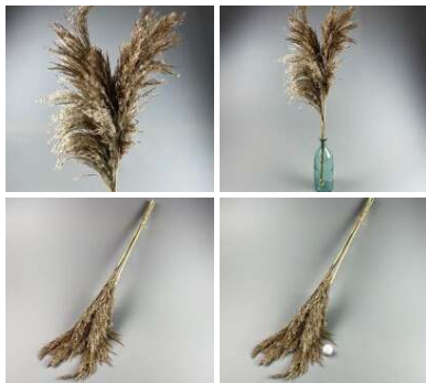
Pampas Grass - Wild Wool x 5 stems, 1.1m long dried bunch.

Sold per five stems. Great for interesting shape and textures.