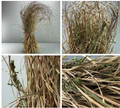
Sedge and Wild Bog Myrtle Bundle, approx. 1 m plus tall by 30 cm wide. Natural, dried, thatching material

Long grassy material commonly grown in marsh land. Ideal for set dressing.