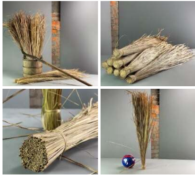
Dried Mellow Grass Bundle, 1 m long x 4 cm wide bunch of natural dried floral decoration