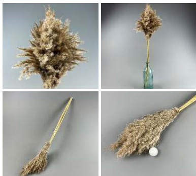
Pampas Grass - Tan Brush x 5 stems, 1m long dried bunch.

Sold per five stems. Great for interesting shape and textures.