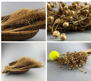
Bobble Grass Bunch, approx. 70 cm long by 20 cm Wide. Natural Dried Floral Deco